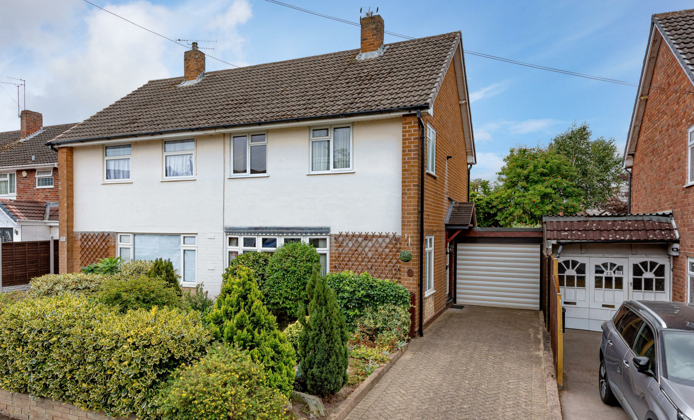
21 Langley Gardens, Wolverhampton, WV3 7JN